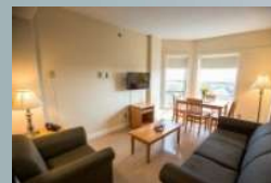
Apartment Style Room

Where Can I Stay? The residence facilities at Mount St. Vincent University will be available to participants who wish to stay on campus and within walking distance of all venues. For current rates contact MSVU conference services at conference.office@msvu.ca or by phone at 902-457-6355. Rates will include campus parking, wifi access, linens and athletic pass. Be sure to mention the Band Fest 2023 weekend in order to access any possible special rates.